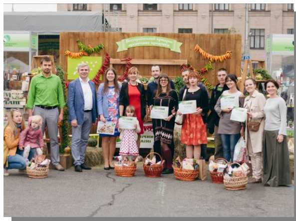
Photo contest "Organic family" arranged by Green Dossier (01.05-17.09.2017); the winner of it with the best photo and six lucky ones were rewarded with baskets filled with exclusively organic certified products from Ukrainian producers. The awarding of the winners took place within the 9th All-Ukrainian Organic Open-Air Market-Fair (23.09.2017, Kyiv city, 35 exhibitors). More information and results: http://organicinfo.ua/ocontentsts.html .

New web resource for consumers with background information about organic, sector events, news etc. is developed by Green Dossier http://organicinfo.ua .