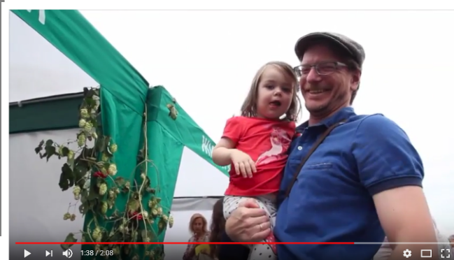
Органічні продукти – смачного!