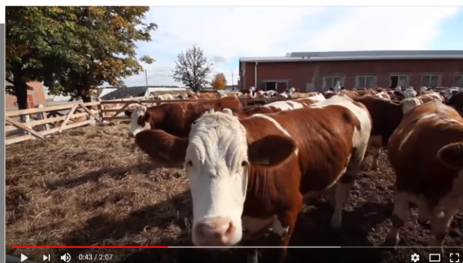
Органічне виробництво – чесно